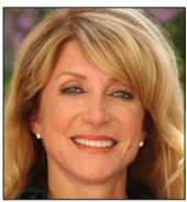
Wendy Davis Texas State Senator

community college, Wendy transferred to Texas Christian University. With the help of academic scholarships and student loans, Wendy not only became the first person in her family to earn a bachelor's degree, but graduated first in her class and was accepted to Harvard Law School.