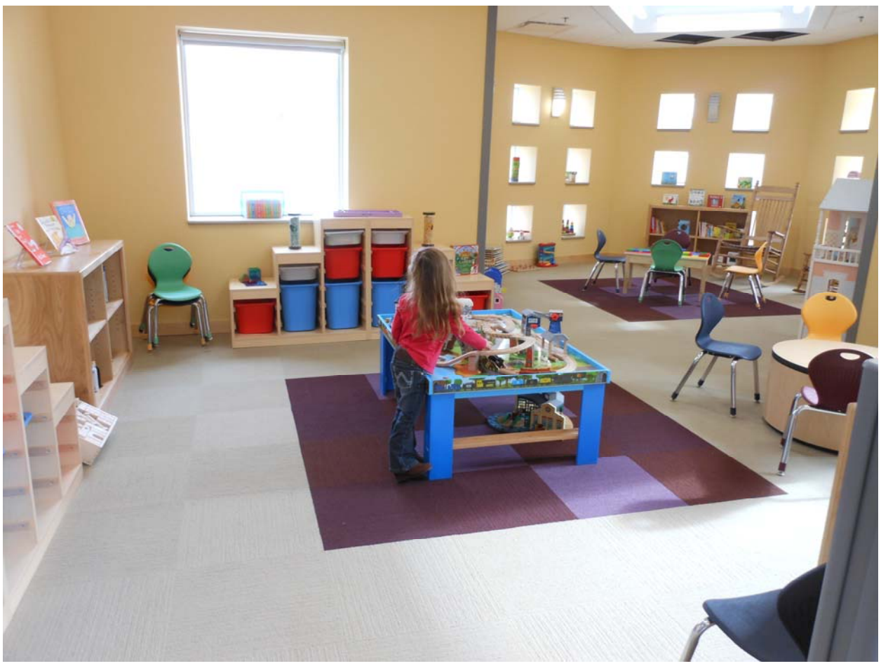
The first child playing in the visiting room.