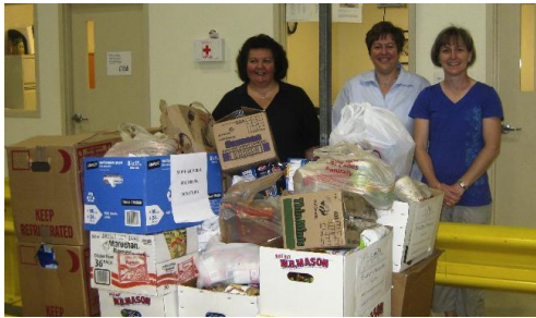
NH WBA's Fourth Food from the Bar Campaign