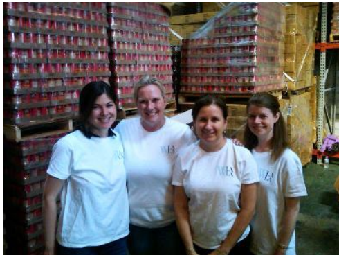
Women Lawyers Assoc. of Los Angeles Food from the Bar