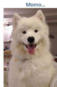
...loves walks in the park, tug of war, and cuddles.